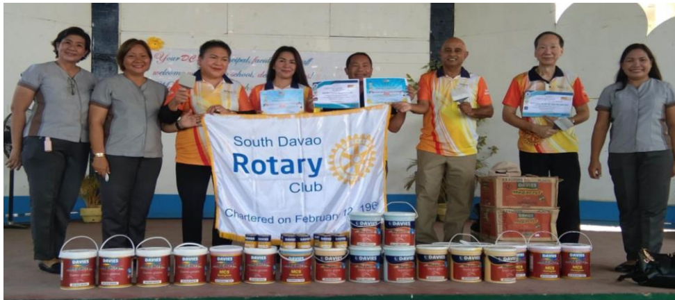
Turnover of paints to SPED Elem. School for the mural painting. Aug. 24, 2022