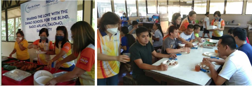
Feeding & Gift Giving to the students of Davao School for the Blind in partnership with Share Me a Dream Foundation (Australia). Aug. 19, 2022