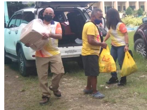
Turnover of digital BP monitor, weighing scale, thermometer, cleaning materials and other medical supplies to S.I.R. Elementary School. Aug. 24, 2022