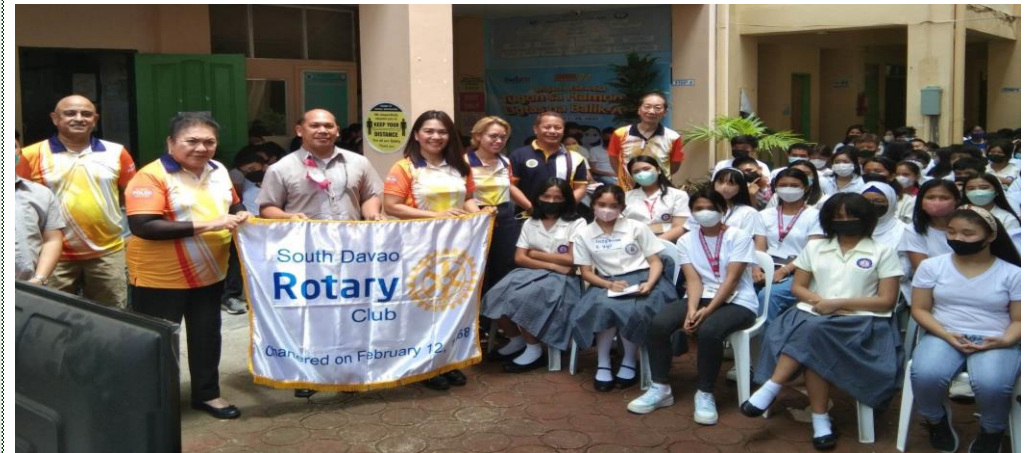
Turnover of paints and sacks of cement to SPED National High School. Aug. 24, 2022