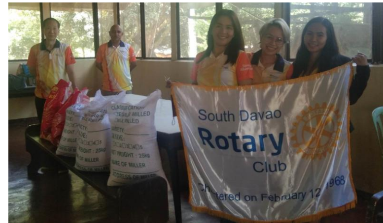
RCS D donated sacks of rice to Davao School for the Blind Aug. 24, 2022