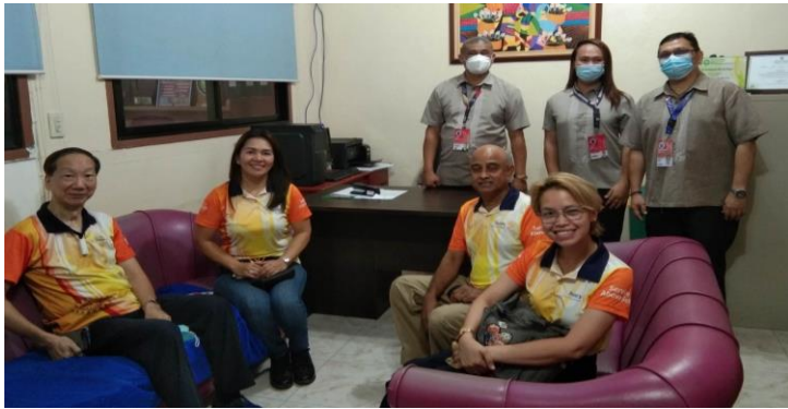
Turnover of paints, cleaning materials and medical supplies to Mabini National High School. Aug. 24, 2022