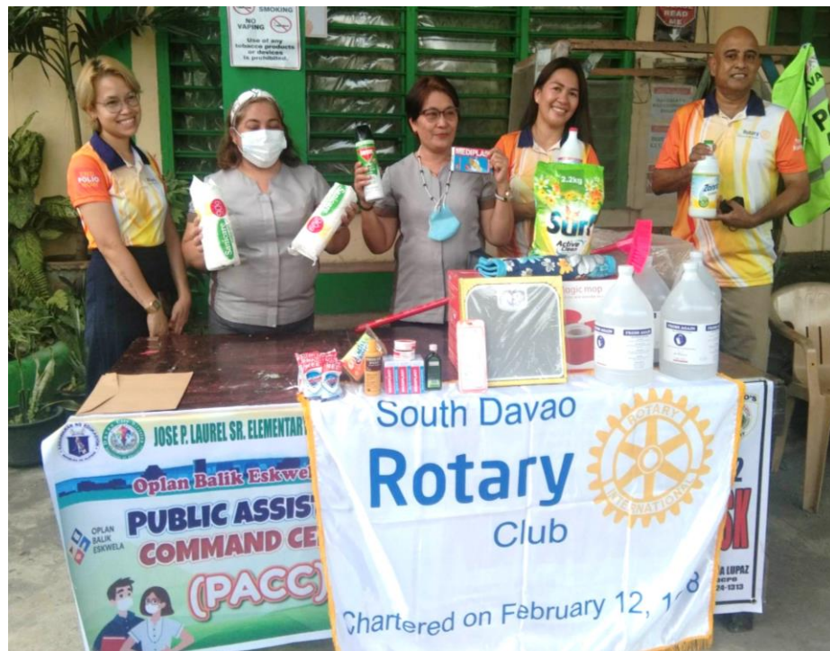
Turnover of cleaning materials and medical supplies to JP Laurel Elem. School. Aug. 24, 2022